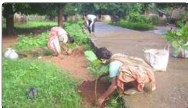
WSHG member during roadside plantation activities

road side and awareness campaign for forest protection in its project villages