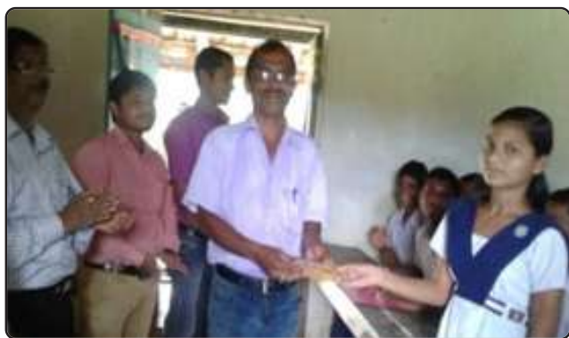
Student receiving prize for competition on financial inclusion

School level competitions were organized in Chaturbhuj High School and BJN High School of the project area with an aim to aware the students on financial inclusion, savings and use of money in productive work as a result of which 160 students from both the schools started savings from their pocket money and also opened individual bank accounts.