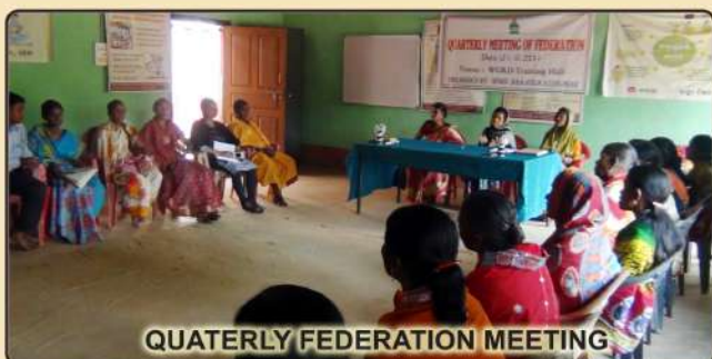
QUATERLY FEDERATION MEETING