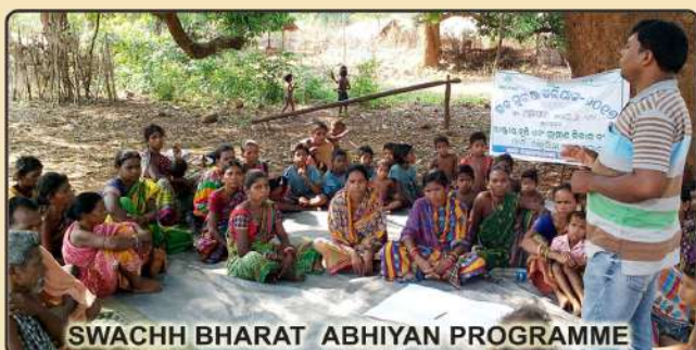
SWACHH BHARAT ABHIYAN PROGRAMME