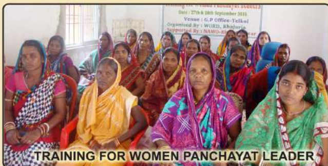
TRAINING FOR WOMEN PANCHAYAT LEADER