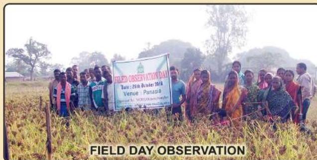
FIELD DAY OBSERVATION