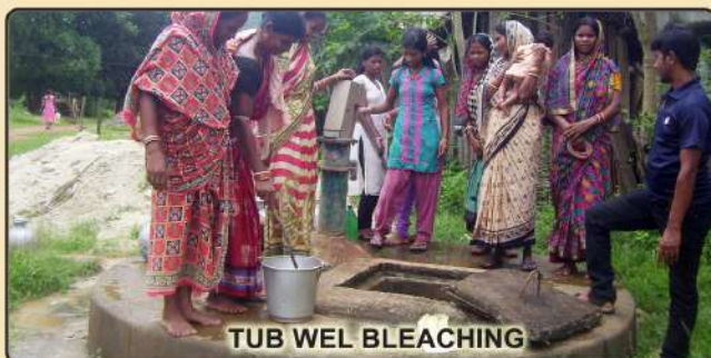
TUB WEL BLEACHING