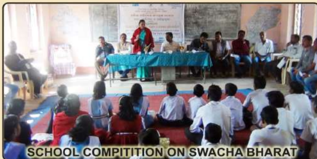
SCHOOL COMPETITION ON SWACHA BHARAT