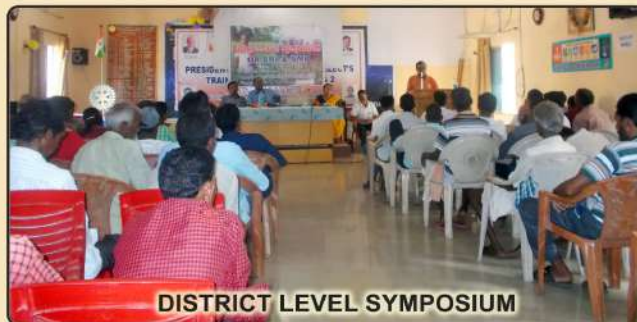
DISTRICT LEVEL SYMPOSIUM