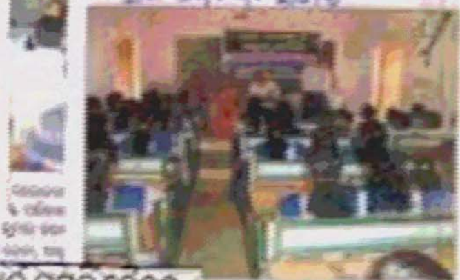
ସେକେଣ୍ଡାରୀ ଆର୍ଥିକ ସାମାଜିକ କାର୍ଯ୍ୟକ୍ରମରେ ଯୋଗଦେଇଛନ୍ତି ଶିକ୍ଷକମାନେ।