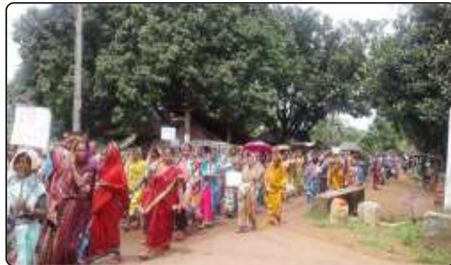
Campaign against liquor consumption

Women empowerment is the major thrust of WORD and most of its activities are designed and implemented catering to the need of women. With an objective to develop the socio economic condition of the women & empower them by building their capacity to fight for their rights and getting involved in successful implementation of different Govt. programmes, WORD has undertaken a special project in Bhimakanda & Podanga G.P. of Telkoi Block. Under this project, different activities were undertaken that include organizing anti-liquor campaign, training & capacity building of WSHGs on domestic violence & gender discrimination, generating awareness on importance of education and observation of International women's Day to celebrate womanhood. Some of the major achievements under this project are: