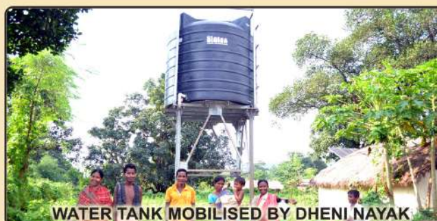
WATER TANK MOBILISED BY DHENI NAYAK