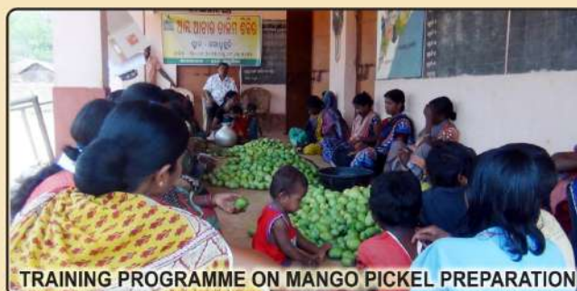
TRAINING PROGRAMME ON MANGO PICKEL PREPARATION