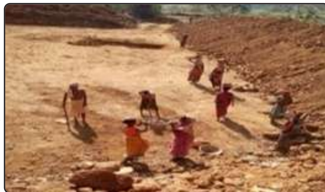
Work in Progress under MGNREGS

Social audit programmes were organized in 22 G.P.s of Telkoi Block through Gram Sabhas. In total 2289 participants including Job Card Holders, PRI members, Gramsathis, SHG members, CBO members attended the Gram Sabha Meetings. Details were discussed on the status of work being done under MGNREGS and discrepancies arose out of them. The problems were pointed out and subsequently appraised to the concerned authorities for immediate sort out. Some of the results of social audit include: