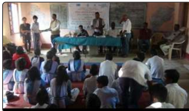
School level debate competition on swachh bharat mission

In order to accelerate the effort to achieve universal sanitation coverage and to put focus on sanitation, Swachh Bharat Mission was launched on 2nd October, 2014. WORD has put its sincere effort to make its project villages tidy and clean. Both software & hardware activities were undertaken in this direction. School level competitions were organized at village and block level to in still the habit of cleanliness among students on the one hand and with construction of IHHLs and awareness generation on use of latrine, sanitation drive is promoted at the project villages. Total 415 IHHLs constructed in Akul and Bhimakand GP, benefitting 2000population.