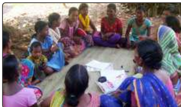
Orientation Programme to Adolescent girls on Menstrual Hygiene

Increasing access of women to natural resources increases the scope for reduction of women exploitation and helping them in leading a life of dignity. This enhances the scope for women to earn more and recognize their effort in family and society as well. Apart from making women self-sustainable and empowering and enabling them to be the economic backbone of their respective families, WORD also involves them in awareness, sensitization, meeting, training and lobby & advocacy programmes for exhibiting their role as change agents in the overall socio-economic-political and cultural development of the community. During this reporting period, a number of sensitization/awareness camps, capacity building training & exposure visits, meetings, interface etc. were conducted for the women groups, adolescent girls and other stakeholders to accelerate the process of development in the project villages and also integrate the vulnerable population in the mainstream of development. Some of the achievements under this project are :