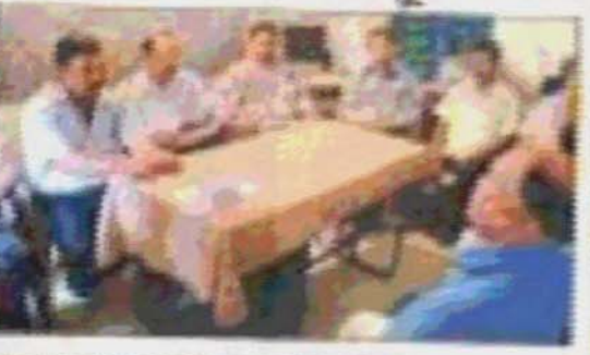
ଚଳୁଥିବା ଶିବିର ପାଇଁ ପ୍ରସ୍ତୁତ କେତେକ ଶିକ୍ଷକମାନେ ଯୋଗଦେଇଛନ୍ତି।