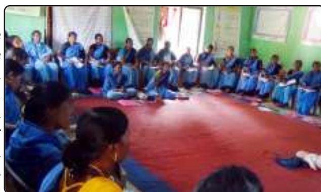
Asha training on RMNCH+A

Health management is a composite issue and WORD put its sincere effort to address the different aspects of health management with special emphasis on maternal and child health (MCH), adolescent health and community health. In this regard, training to ASHAs was conducted for properly rendering their services at door step on RMNCH+A, having clarity on their & responsibilities. Community level frontline workers like the AWWs, ASHAs, panchayat representatives, Gram Sath is, SHG leader were also oriented on different social security schemes and benefits of Govt in order to make them available to the community members as per their eligibility and requirement. Emphasis was laid on complete immunization of children in the project villages with community mobilization. Adolescent students were also sensitized on reproductive & sexual health and maintaining menstrual cleanliness & hygiene. Some of the major achievements under the health initiatives are :