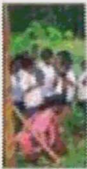
ସେକେଣ୍ଡାରୀ, ଏମ୍.ଏସ୍.ଏସ୍. ଶାଳାରେ, ପ୍ରଥମ ଶ୍ରେଣୀର ଶିଶୁମାନେ ଶିକ୍ଷକଙ୍କ ସହିତ ଶିକ୍ଷଣ କାର୍ଯ୍ୟକ୍ରମରେ ଯୋଗଦେଇଛନ୍ତି।