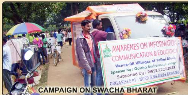
CAMPAIGN ON SWACHA BHARAT