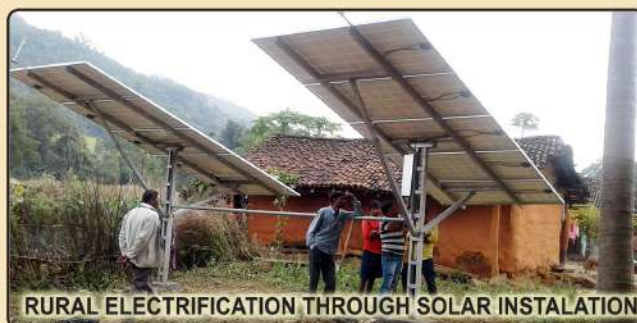
RURAL ELECTRIFICATION THROUGH SOLAR INSTALATION