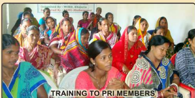
TRAINING TO PRI MEMBERS