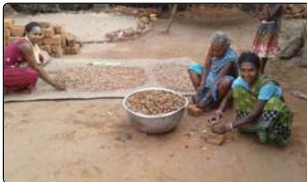
NTFP processing at household level

A scheme for promotion and financing of Women Self Help Groups (WSHG) is being implemented by NABARD across 150 backward and Left Wing Extremism (LWE) affected districts of the country. The scheme aims at saturating the districts with viable and self sustainable WSHGs by involving anchor NGOs/support agencies who shall promote and facilitate credit linkage of these groups with banks, provide continuous handholding support, enable their journey for livelihoods and also responsibility for loan repayments. In this context, Keonjhar being one of such Districts, WORD with support from NABARD has promoted 52 WSHGs and provided training to the WSHG leaders on micro entrepreneurship development. Some of the major achievements in this project include :