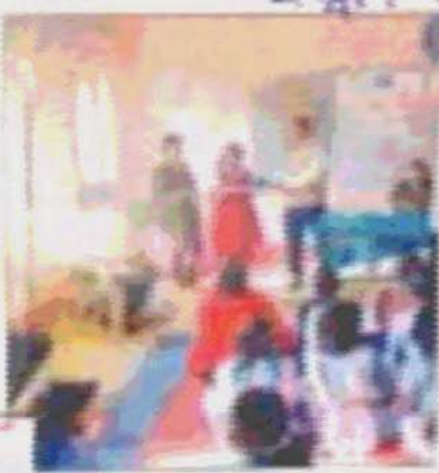
ସେକେଣ୍ଡାରୀ, ଏମ୍.ଏସ୍.ଏସ୍. ଶାଳାରେ, ପ୍ରଥମ ଶ୍ରେଣୀର ଶିଶୁମାନେ ଶିକ୍ଷକଙ୍କ ସହିତ ଶିକ୍ଷଣ କାର୍ଯ୍ୟକ୍ରମରେ ଯୋଗଦେଇଛନ୍ତି।