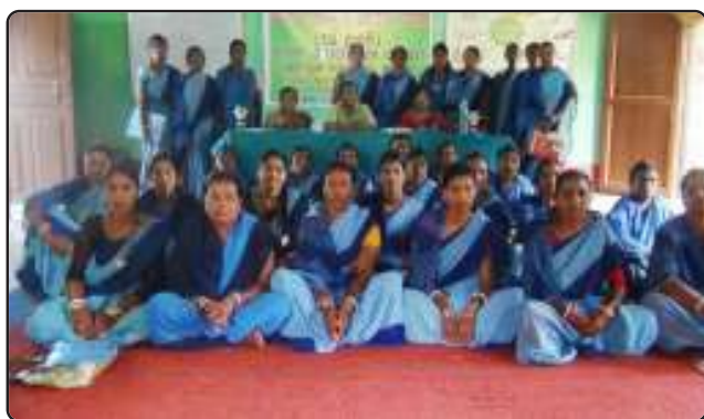
Asha training on RMNCH+A