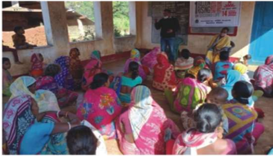
1 BILLION RAISING