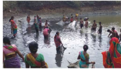
FISHERY IN POND