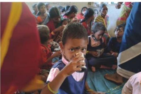
PRE-SCHOOL NUTRION & EDUCATION PROGRAM