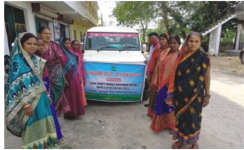
EXPOSURE VISIT TO FEDERATION LEADER