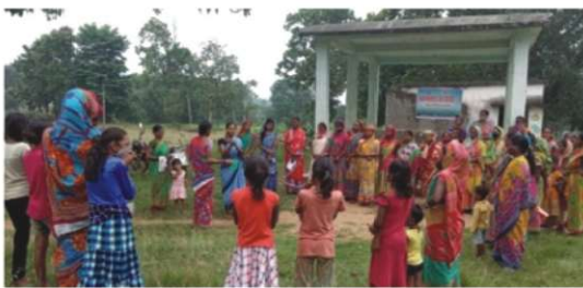
AWARNESS ON COVID-19