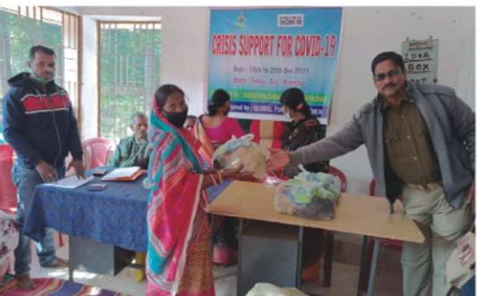
CRISIS SUPPORT DURING COVID-19