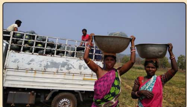
Selling of watter mellon by SHG member