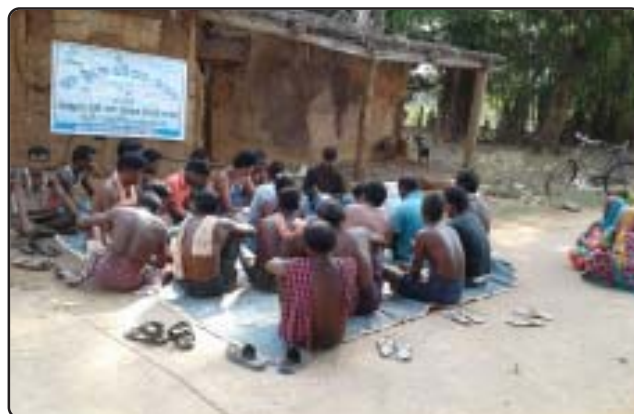
Village meeting for water conservation