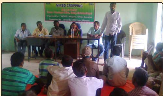
Trg. to Farmers on mixed Cropping