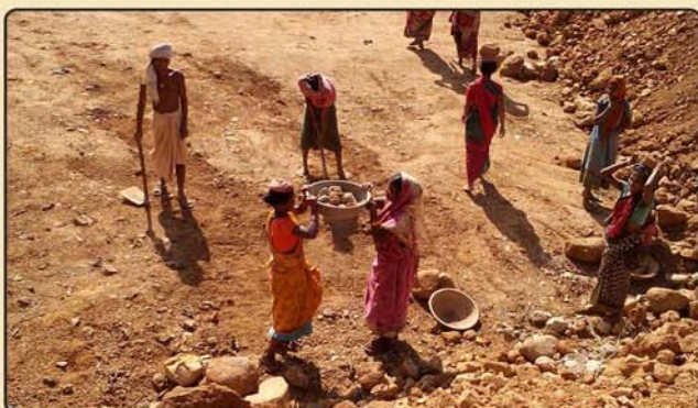
Village Infrastructure Develop Under MGNREGA