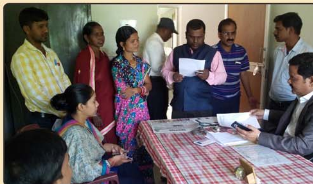
Submission of Memorandum to Line Deptt.