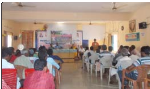
District level Symposium

This has resulted in 812 farmers adopting SRI (Lalat, Swarna, Bikarm, Super Kalpana, Kanak, 1001, Kamal, Sadhana, Sahabhagi and Puja etc) in 457.8 acres of land. 203 farmers cultivated aromatic paddy (Kalajira, Basumati) in 112.2 acres of land, 1033 farmers cultivated through SMI in 324.5 acres of land, 45 farmers cultivated pulses (Arhar) in 35 acres of land. 731 farmers were provided with inputs like seeds, weeders, rope markers and INM for undertaking cultivation. 100 numbers of farmers were also taken inside exposure visit to Gonasika, Hatisila village of Banspal block, Jamujodi and Monoharpur village of Harichandanpur block to gain knowledge on success of SRI and SMI. One case study booklet was printed covering 22 successful farmers. Moreover, farmers were mobilized for agricultural, technical and financial support from Line department in Khariff season. As a result Rs.1, 38, 320/- was mobilized from KVK, ATMA, Keonjhar and Dept. of Agriculture, Harichandanpur Block. Value chain study was undertaken for aromatic paddy and millet cultivation and two seed village were established where farmers produced variety of paddy seeds like New Kalajira , Basumati and Ragi namely Vairabi . Farmers/producers had produced and sold paddy, arhar, wheat, aromatic paddy, millets and green gram and fetched good price for their produces.