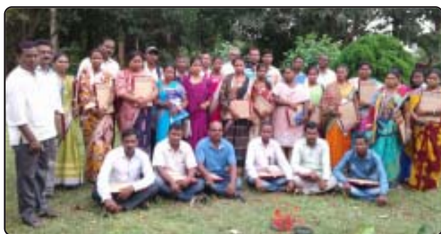
GPDP training to PRI leaders