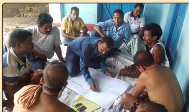
Micro Plan on Water Conservation