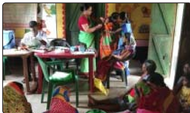
Vaccine delivery & immunization