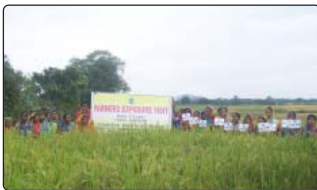
Farmer's Exposure Visit

Training on agriculture to women was also organized to impart training to 54 women farmers. One District level symposium of farmers was also organized on adoption of SRI & SMI. 15 numbers of wall writings were also done.