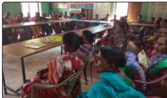
Grass roots level training to SHGs

Self help groups are necessary to overcome exploitation, create confidence for the economic self-reliance of rural people, particularly among women who are mostly hidden in the social structure. These groups enable them to come together for common objective and gain strength from each other to deal with exploitation, which they are facing in several forms. A group becomes the basis for action and change. It also helps in building of relationship for mutual trust between the promoting organization and the rural poor through constant contact and genuine efforts. Self help groups play an important role in differentiating between consumer credit and production credit, analyzing the credit system for its implication and changes in economy, culture and social position of the target groups, providing easy access to credit and facilitating group/organization for effective control, ensuring repayments and continuity through group dynamics; setting visible norms for interest rates, repayment schedules, gestation period, extension, writing of bad debts; and assisting group members in getting access to the formal credit institutions.