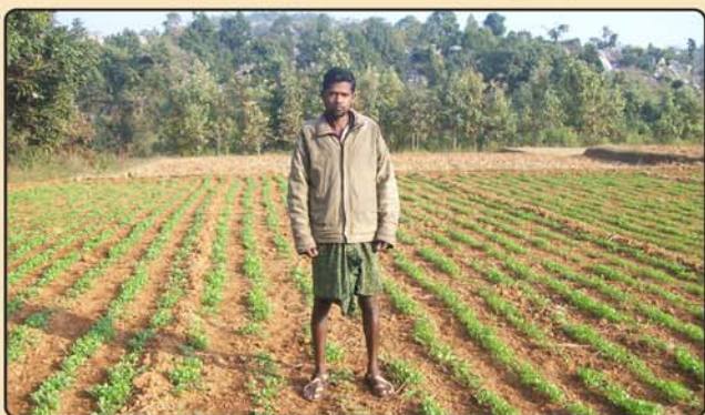
Line sowing of Mustard Cultivation