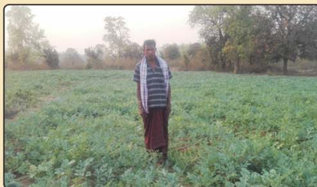
Water Mellon Cultivation at Dimirimunda