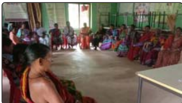
Federation members review meeting

problem etc. More over they were oriented to act as leader for societal change and mainstreaming the down trodden.