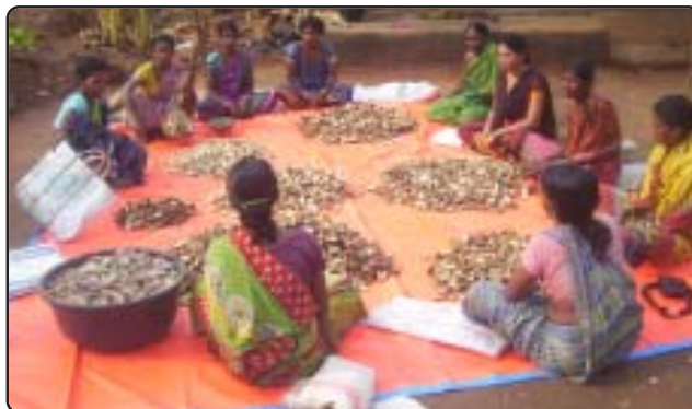
Women engaged in Mango Processing Activities