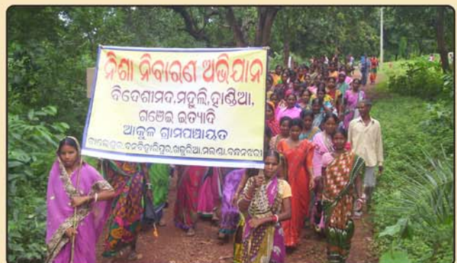
Rally on Prohibition of Alchohol By SHGs