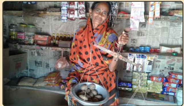
Micro Enterprinuership Programme