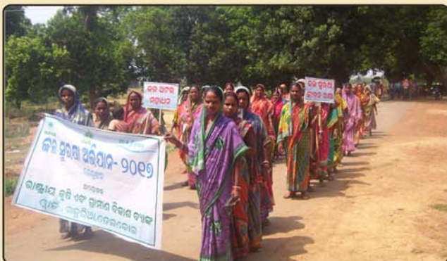
Save Water Campaign Rally