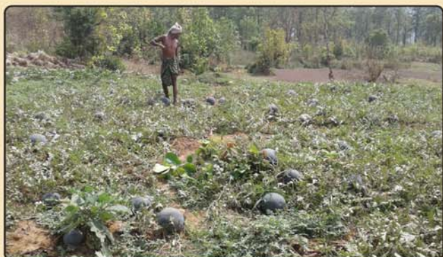
Water Mellon Cultivation