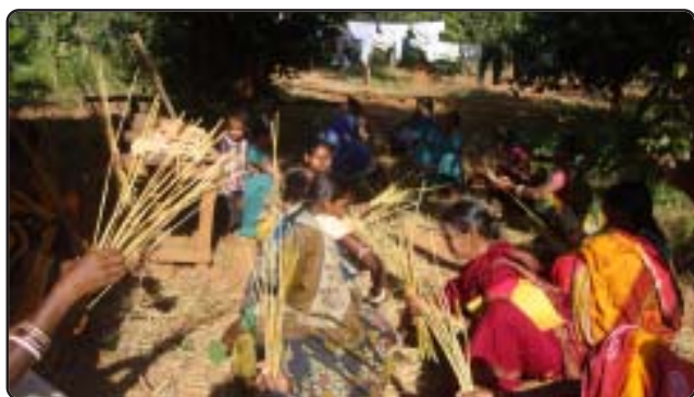
Enterprise development by SHGs

Rural Entrepreneurship Development Programme (REDP) is organised by WORD for creation of sustainable employment and income generating opportunities to benefit the rural and tribal youths. The