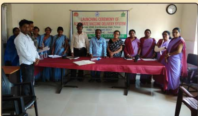
Launching Ceremony of AVD Programme