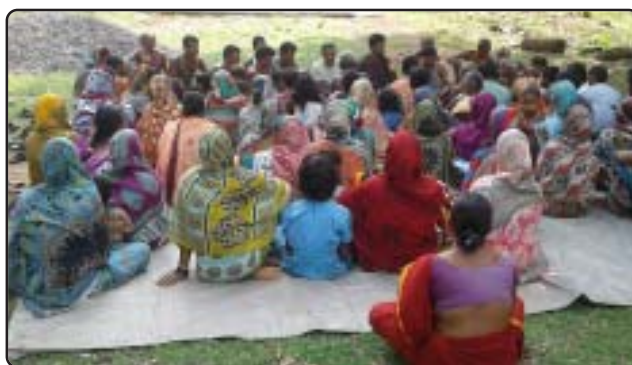
Community meeting for CFR claim

WORD is working on the Scheduled Tribes and Other Traditional Forest dwellers (Recognition of forest Rights) Act, 2006 to the concerns on the rights of forest-dwelling communities to land and other resources. The organization is addressing right and entitlement issues of forest dwellers focusing on FRA land entitlement to improve their life styles. Different program like awareness generation, Reformation of FRA committee, capacity building and community mobilization, submission of community claim with the procedure etc. has been carried out in 4 blocks of Keonjhar and Deogarh District.