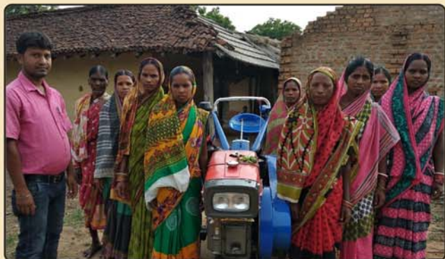
Power Tiller managed by SHG Members