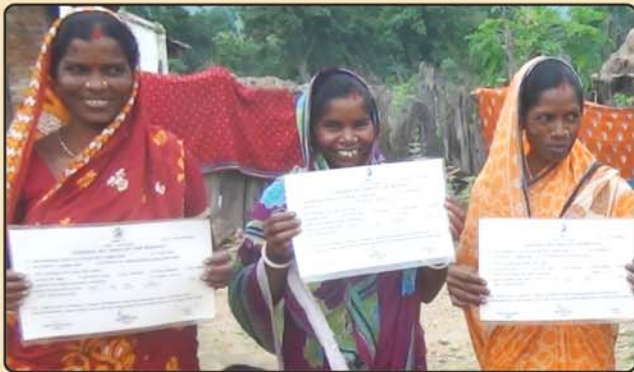
Got FRA Land Patta By women