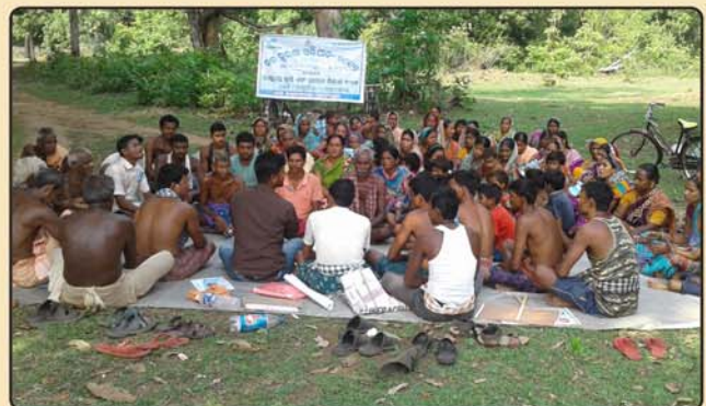
Village Plan for Water Body Management