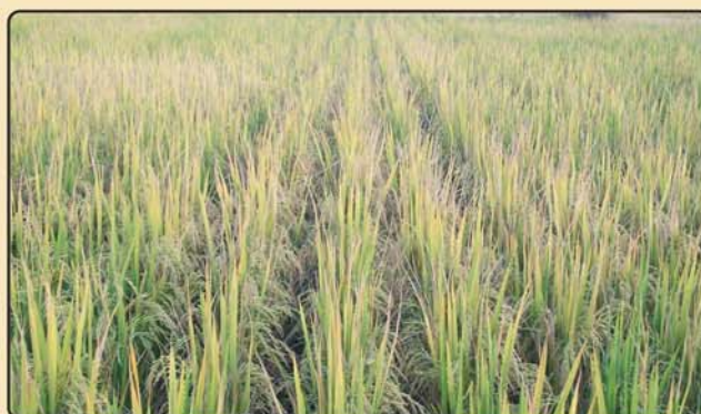
SRI Cultivated Field