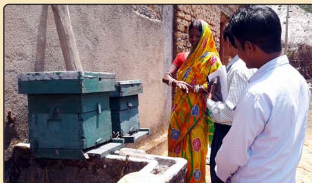
Bee Keeping by SHGs Members