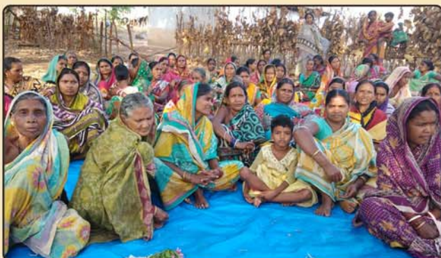
Participation of Women in Pallisabha