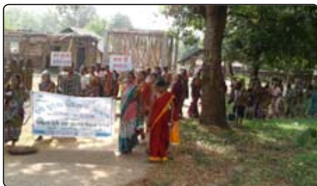
Women in a rally on water conservation