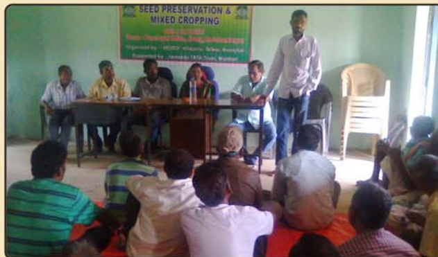
Farmers Training on Seed Preservation