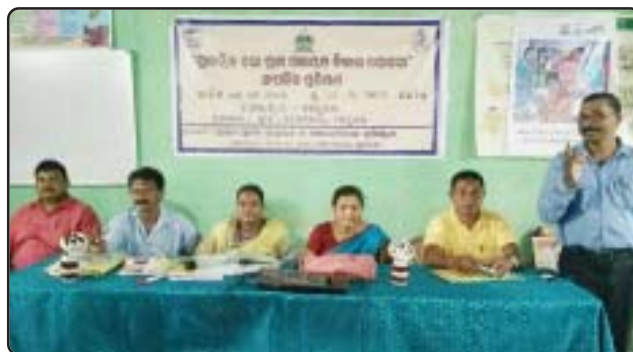
RP orienting the PRI members