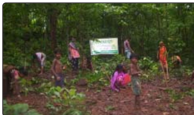
SHG members engaged in Bana mohastab