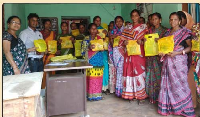
Vegetable seeds distribution for cultivation