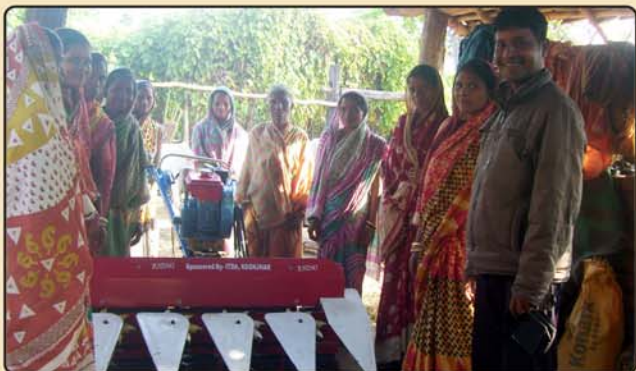
SHG Members with their Powertiller