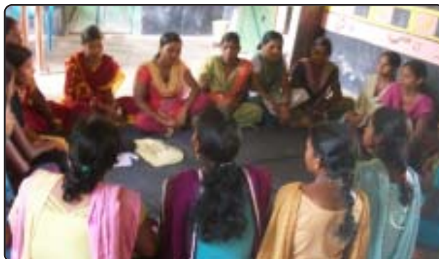
Orientation to Adolescent girls meeting