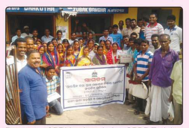
Presence of PRI leaders during GPDP Training