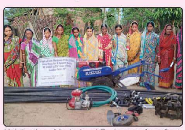
Mobilization of Agricultural Equipments from Govt.