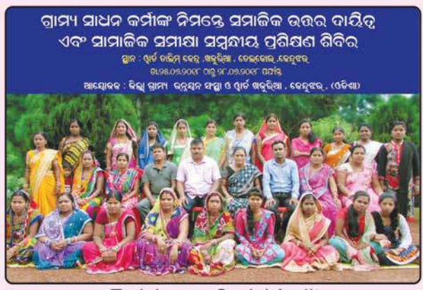
Training on Social Audit