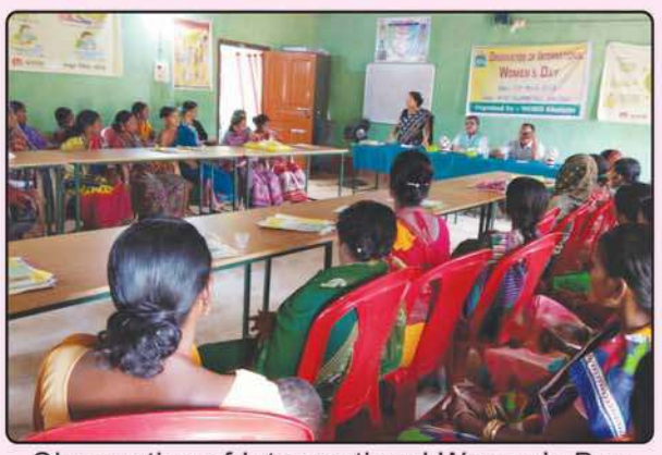
Observation of Inteernational Women's Day