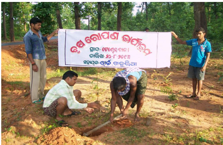
Plantation at Tenteinali village

With support from the Ministry of Environment & Forests, Govt. of India, WORD has made a massive campaign on bio-diversity conservation. Different activities were undertaken like GP level workshop, Pala, street theatre and plantation of medicinal plants in this direction. Members of Women Self Help Groups, school students and PRIs were mobilized through the campaign for plantation of medicinal plants and establishing good relationship with the line departments. They were also sensitized on environment pollution, global warming and green house effects on the community. The programme covered 19 villages under Akul, Sirigida, Bhimkand and Khuntapada GPs of Telkoi Block.