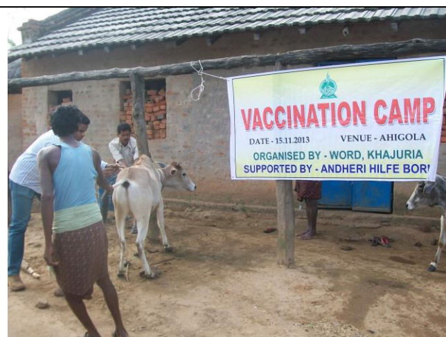
Animal Vaccination Camp