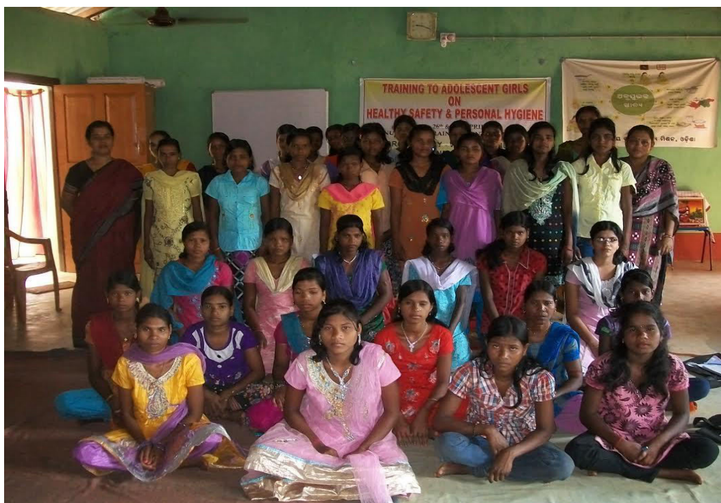
Training to Adolescent girls on personal health & hygiene practices