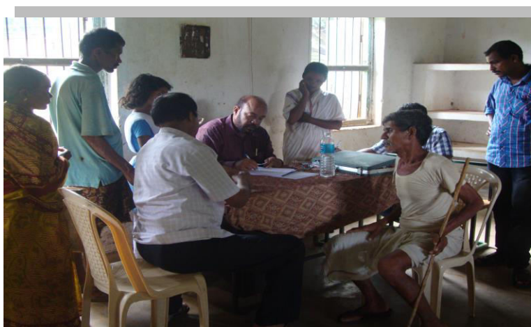
Verification of application under Social Security Schemes

WORD works in 400 villages from Telkoi, Bansapal and Joda Blocks of Keonjhar District and Tileibani Block of Deogarh District, covering a total population of 289987.