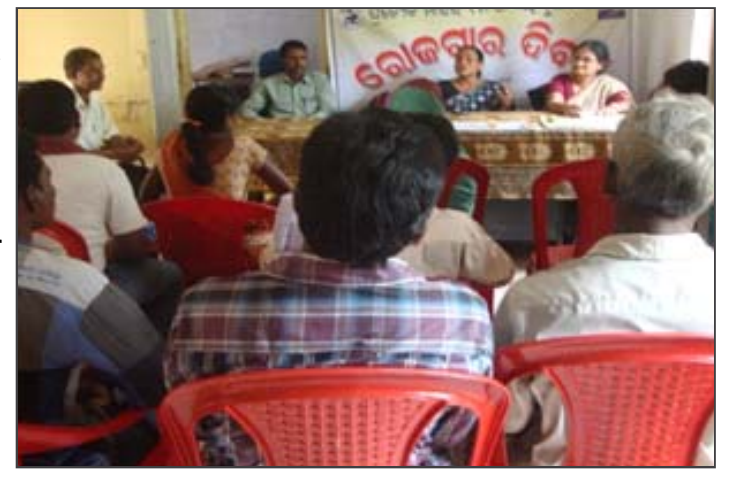
Impact assessment of Political Empowerment

Intervention Component : Under the project different activities were undertaken like training and exposure of elected women representatives, campaign on issues of trafficking, domestic violence, awareness on social security schemes, land right etc.