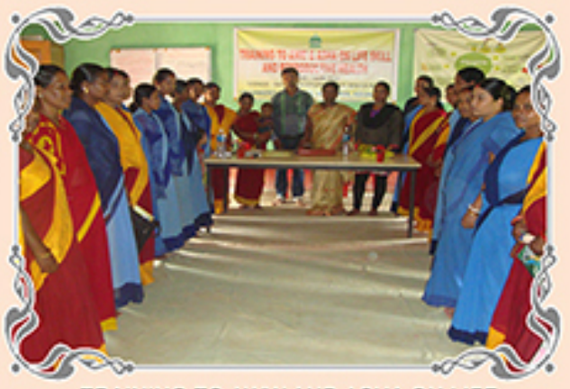
TRAINING TO AWW AND ASHA ON LIFE SKILL AND REPRODUCTIVE HEALTH