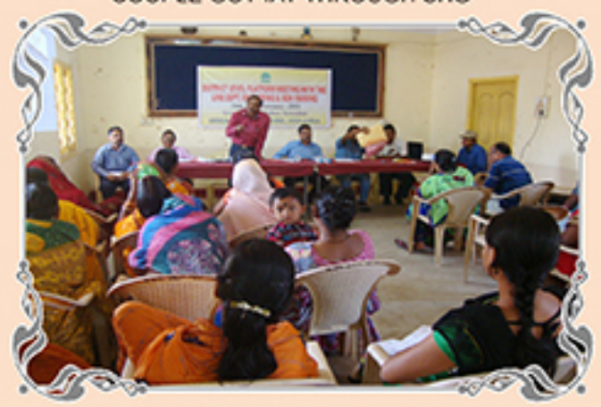
DISTRICT LEVEL PLATFORM MEETING