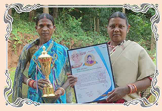
WOMEN MEBER AWADED