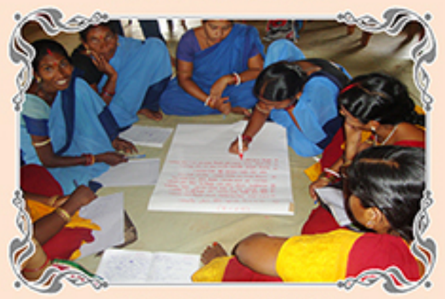
TRAINING TO AWW & ASHA