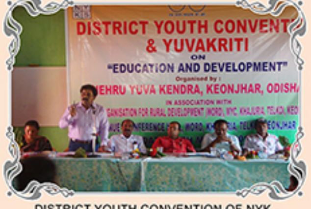
DISTRICT YOUTH CONVENTION OF NYK