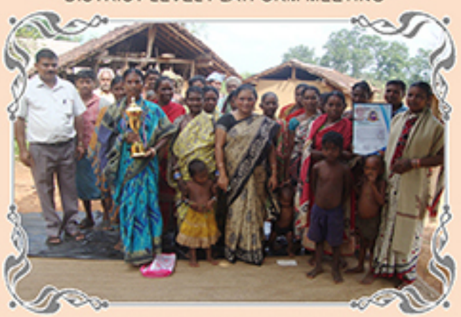
A JOYFUL MOMENT OF SHG