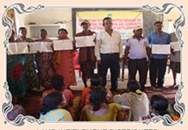
LAND INTITLEMENT DISTRIBUTED DURING ORIENTATION PROGRAMME