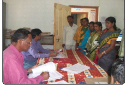
Women were demanding their rights