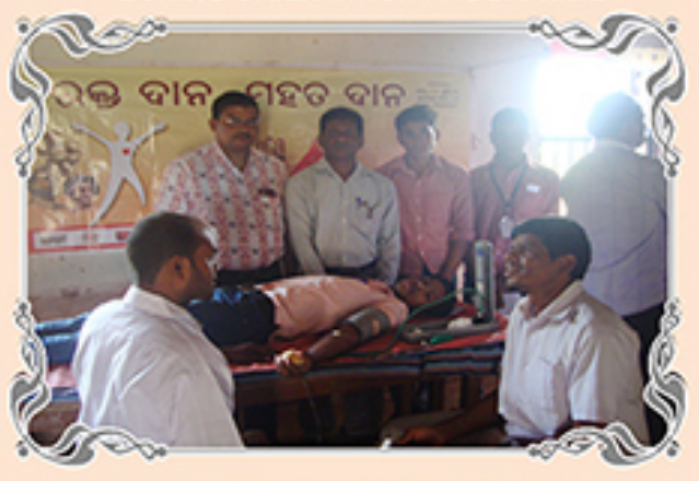
PARTICIPATED IN BLOOD DONETION CAMP