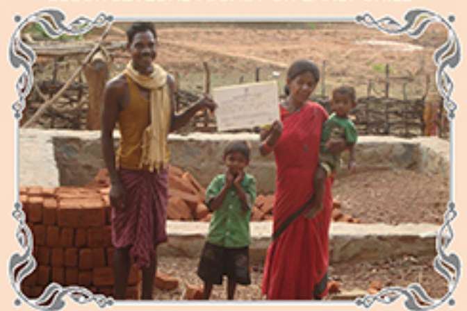
COUPLE GOT IAY THROUGH SHG