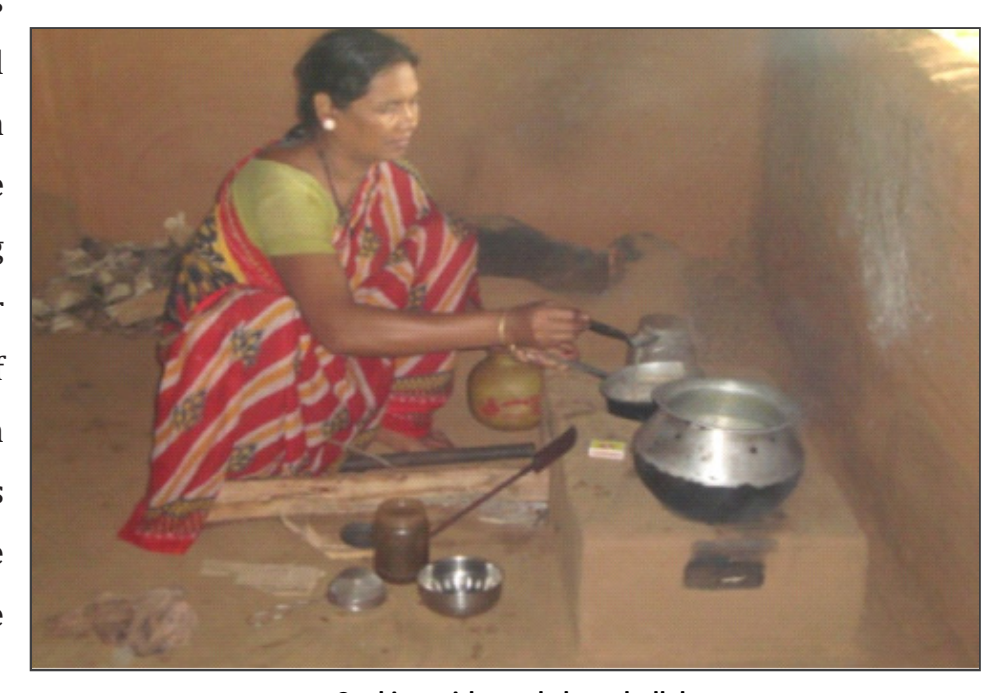
Cooking with smokeless chullah

Orientation to the MIs for marketing and involvement of SHGs in Micro Enterprise activities, hand holding support to the MIs for smooth installation of smokeless chulla in tribal area, awareness generation in the community to use smokeless chullah etc.