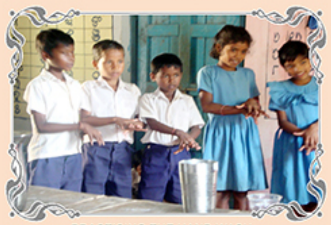
PRACTISING THE HAND WASH