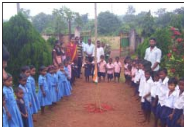
Indipendence Day Celebration

In order to increase access to relevance & quality education for the poor and educationally deprived children of age group between 6 to 14 years, WORD is constantly working in its project villages associating the parents, teachers, PRIs, WSHGs, village level officials like the ASHAs and AWWs and village leaders. In this connection, strengthening the PTA, MTA and SMC has proved to be beneficial as with their active involvement, regularity of the teachers in schools has increased and 11 drop out children were re-enrolled in schools. In order to increase the interest of the students towards education and showcase their inherent talent, regular school level competitions were also organized to encourage them and reward meritorious students. The functionaries of WORD also participated during different functions/programmes of the schools to encourage the students.