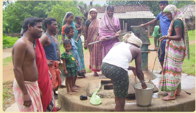
BLEACHING IN TUB WELL