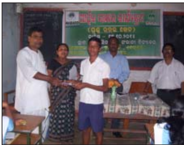
Prize Distribution in High School

Though Indian economy has made rapid growth during recent years, a sizable section of the population, particularly the vulnerable groups, such as weaker sections and low income groups, continue to remain excluded from even the most basic opportunities and services provided by the financial sector. In order to address the issues of financial inclusion, the Government of India constituted a committee which defined Financial Inclusion as “the process of ensuring access to financial services and timely and adequate credit where needed by vulnerable groups such as weaker sections and low income groups at an affordable cost.”