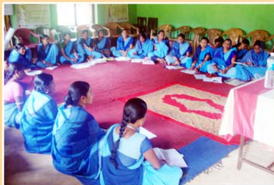
PARTICIPANTS DURING ASHA TRAINING