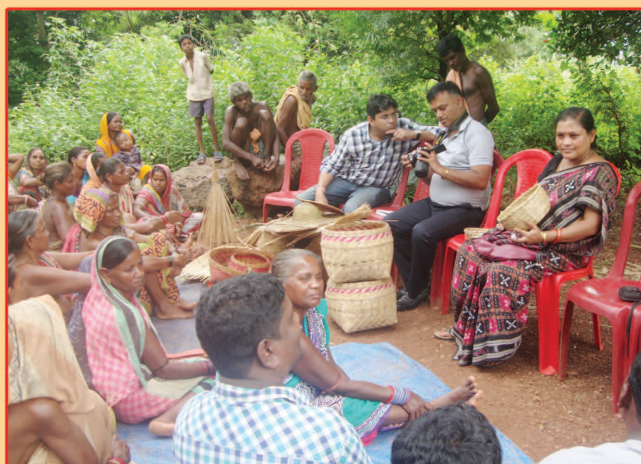
ARTISION MEETING WITH VISITORS