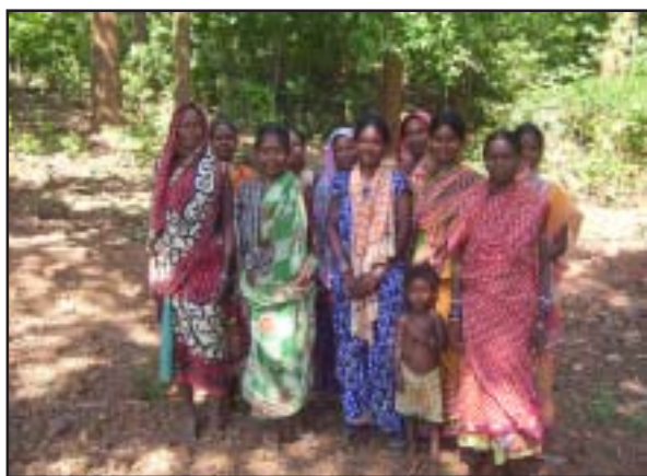
Protected Forest by SHGs

Forest covers about 31.4% of Odisha and provides a livelihood to about 40% of the state's population. Over half of all villages in the state reside inside or on the fringe of forests and Odisha's vast forests are rich in biodiversity and some of the most vulnerable populations in the state, including indigenous tribal groups. The people dwelling in forests need to be respected and protected so that their traditional way of life, and their natural surroundings, can be preserved. WORD believes that people dwelling within and nearby forests of its project area are best placed to manage this