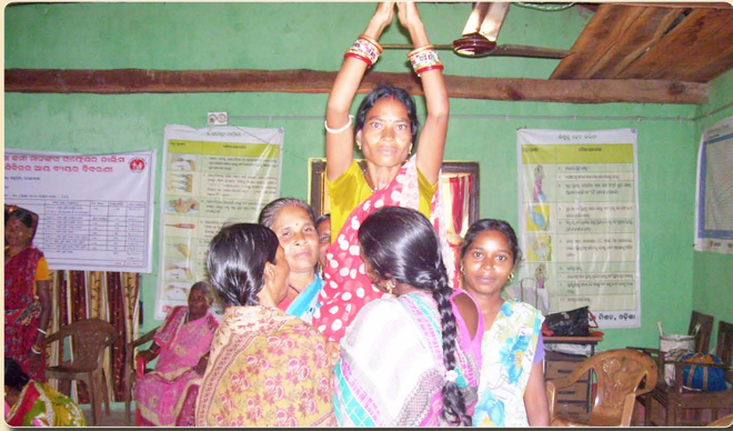
WOMEN DURING THE LEDERSHIP TRG