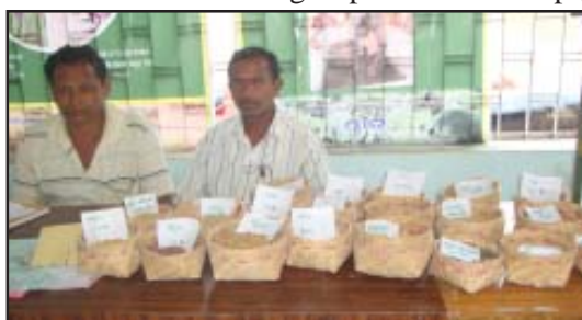
Seed Exhibition in SRI Symposium

and experts on the real challenges they are facing during cultivation of paddy and Ragi. They also enhanced their knowledge on different agriculture schemes of the govt.