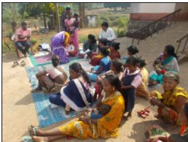
VHND at Village Level