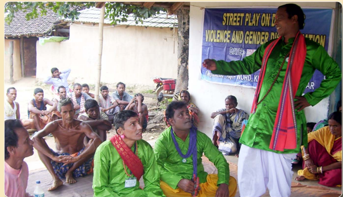
STREET PLAY ON GENDER DESCRIMINATION