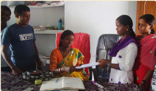
MEMORENDUM TO SARAPANCH FOR ISSUE OF AGE CLEARANCE FOR MARRIAGE