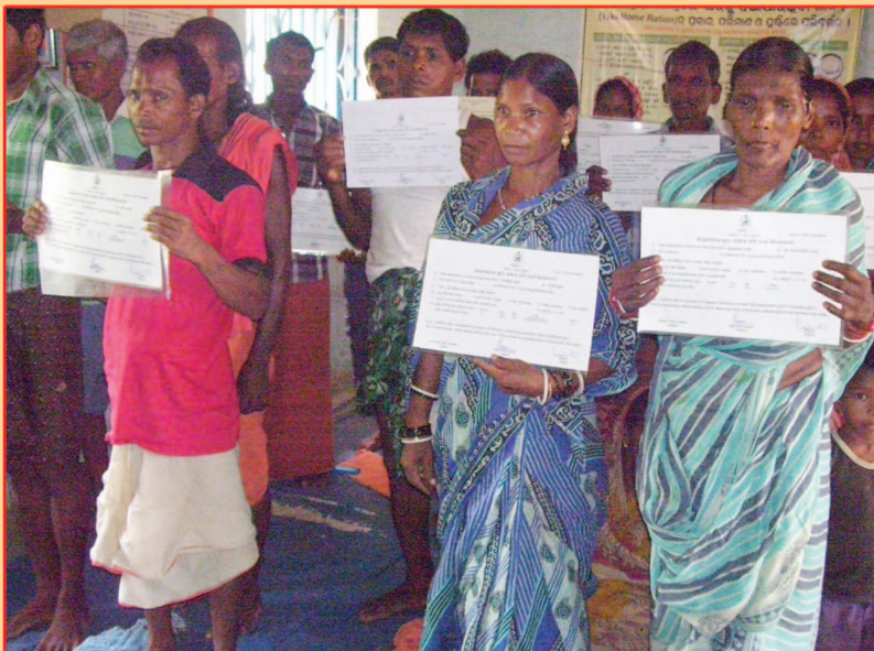
FRA LAND ENTITLEMENT HOLDERS