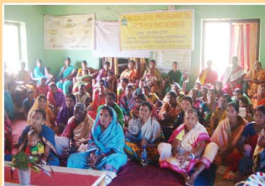
BLOCK LEVEL WORKSHOP ON WOMEN RIGHT