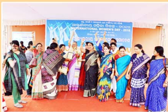
JOINED IN INTERNATIONAL WOMEN DAY CELEBRATION