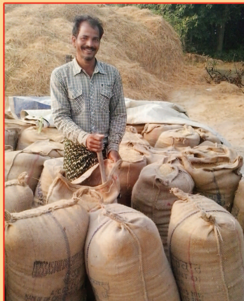
SRI PADDY IS IN PACKING