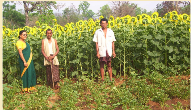
SUN FLOWER CULTIVATION