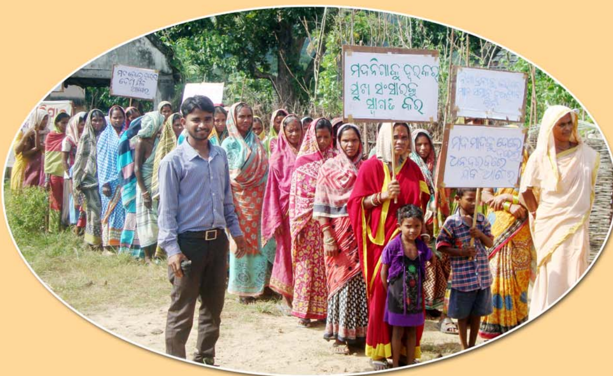
RALLI AGAINST ALCOHOL