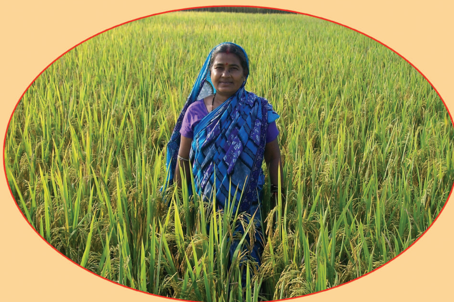
SRI IN GROWING STAGE