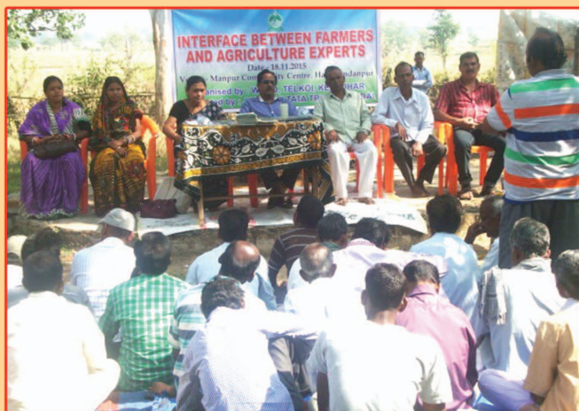
INTERFACE BETWEEN AGRICULTURE EXPORT