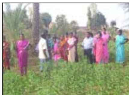
Exposure visit of farmers